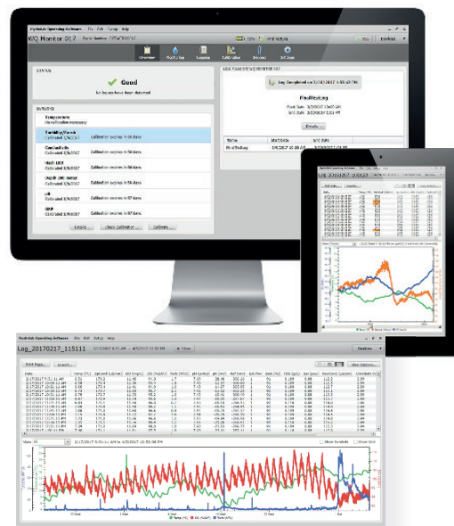
Quickly View Trends

Quickly view the current status of the instrument to ensure proper functionality